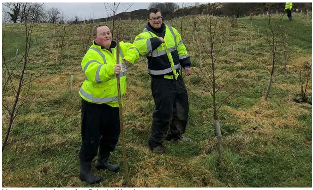
Young people look after Brian's Wood.

An Tobar narrowly missed out on the UK-wide Project of the Year award, showing the power of community when it comes to raising awareness of a heritage project's impact. The UK winner will be announced later in December.