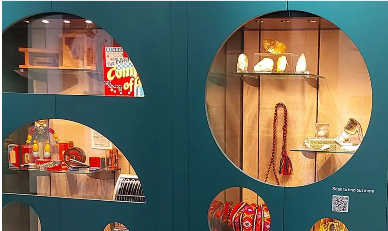
Objects telling the history of Enfield.

The Museum of Enfield are creating a new online cataloguing system that will open up access to their collection. Lunchtime talks, museum lates and new exhibitions will be taking place, aiming to connect the local community with the museum's collection in a new way. Read more about Your Museum of Enfield .