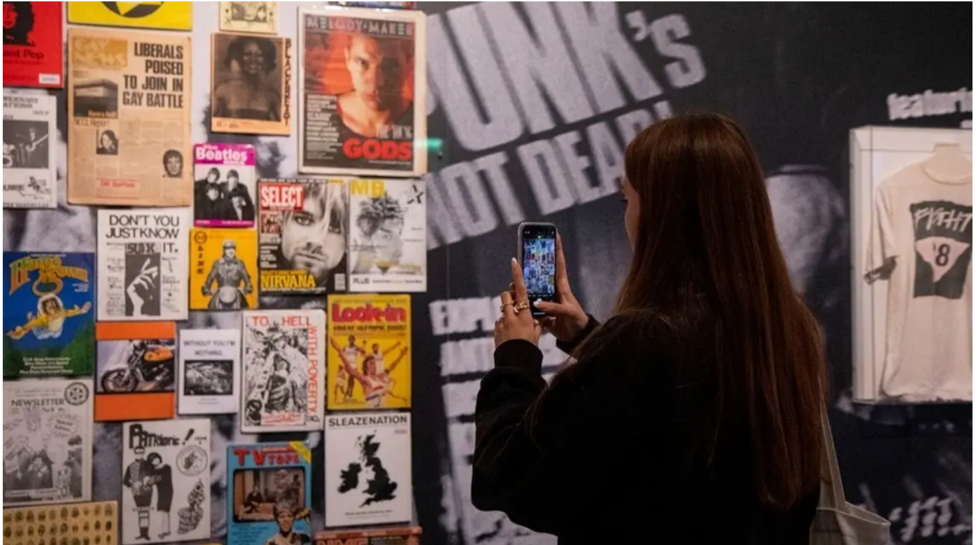
Display of gig posters at The Museum of Youth Culture The Museum of Youth Culture Dynamic Collections

We look at four projects getting underway in museums, libraries and archives that are working innovatively to make the most of their collections.