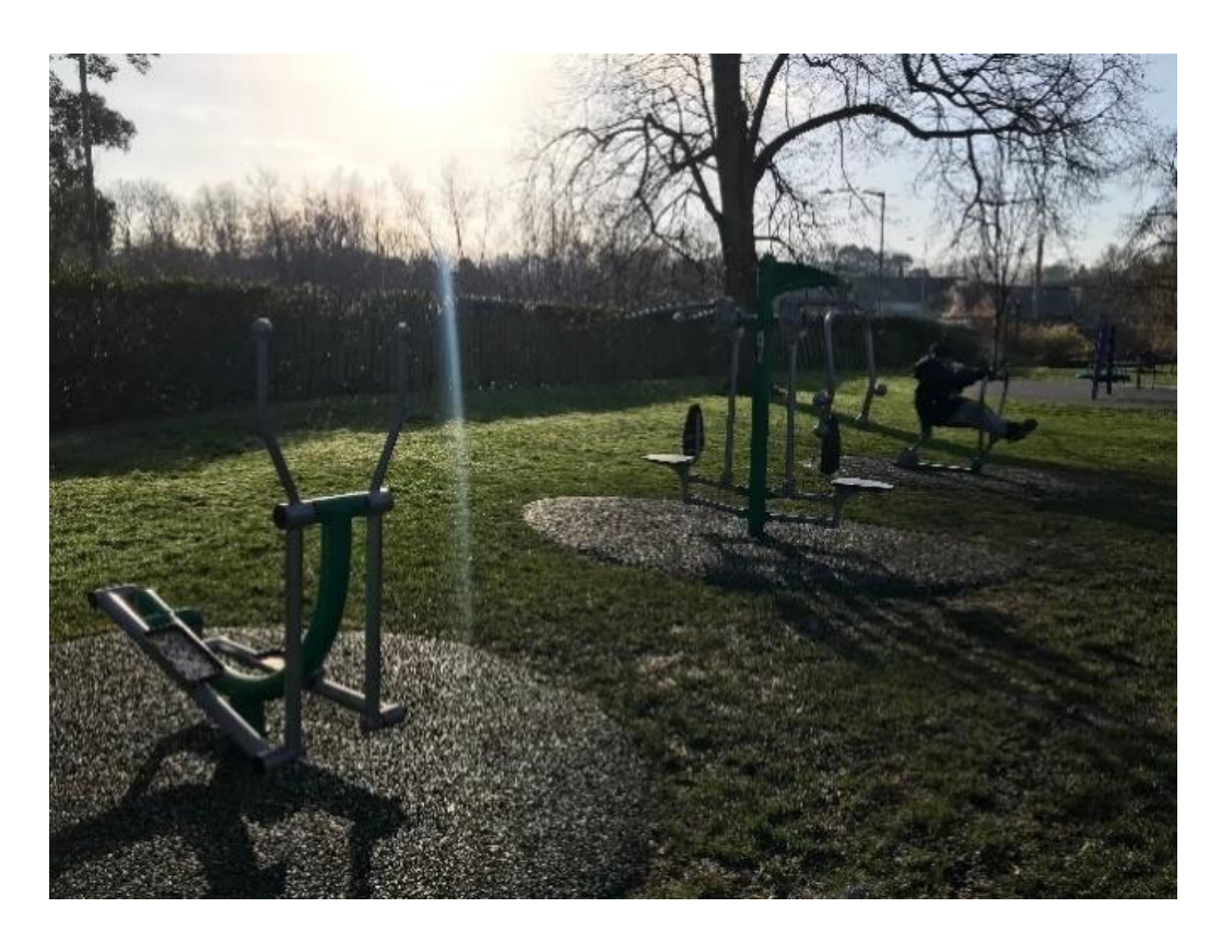
Outdoor gym equipment, January 2020.