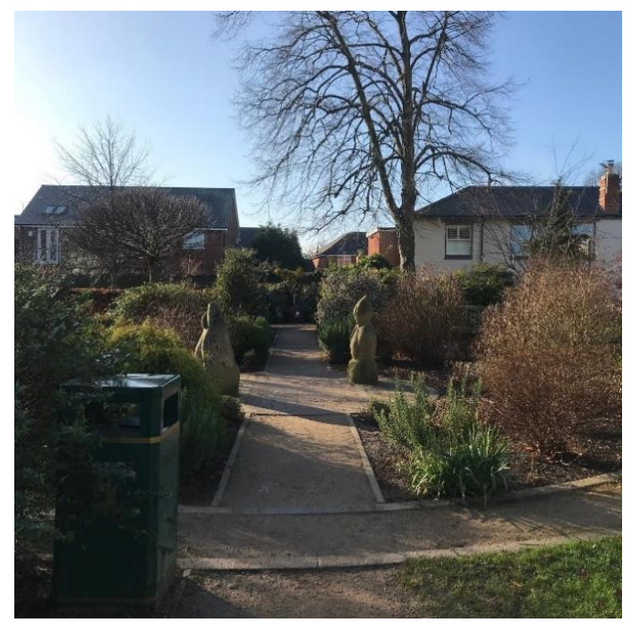
Sensory garden, January 2020.

A key element of the Stafford Orchard project was to make improvements to the ecology within the park, improving habitats for wildlife and providing a natural environment that park users could experience and enjoy. This involved planting of trees and shrubs throughout the park. Gaps in existing hedgerows were filled and new hedgerows were created to maintain and increase the feeding corridors for wildlife. Volunteers planted fifteen thousand spring bulbs and a sensory garden was created at the Station Road end of the park. The plants were carefully chosen to provide colour, fragrance and interest at all times of year. Native wildflower seeds were planted to encourage new wildlife habitats.