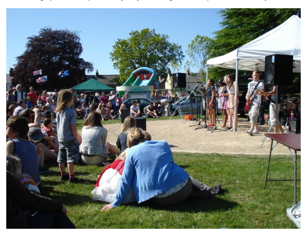
Performance area, Grand opening of Stafford Orchard, May 2011.

Participants felt that Stafford Orchard now provided a safe environment for everyone to enjoy. Previously the park had become quite run-down with graffiti and broken glass putting people off using the park, whereas now the park is seen as welcoming and safe for all. Given the much higher quality of facilities provided and the ongoing maintenance of the park by the groundsman and volunteers, there is now a 'sense of village pride in the park, everybody is looking out to keep it as best as they can'.