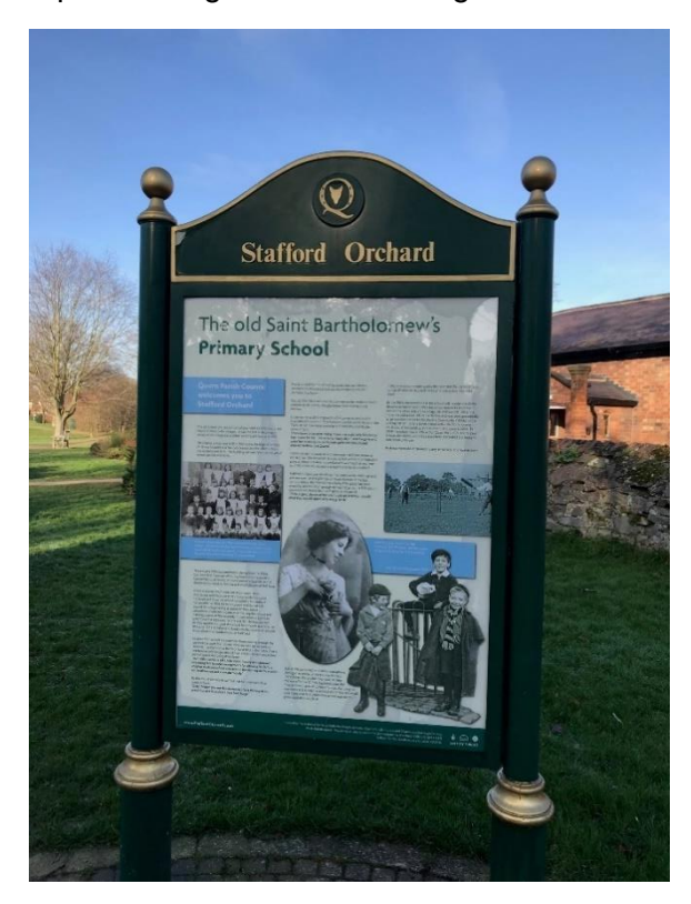
Heritage board, January 2020.