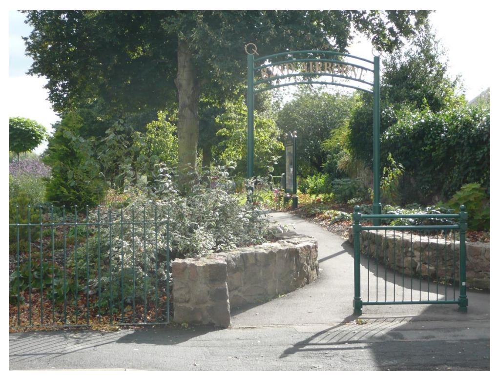
82<sup>nd</sup> Airborne park entrance.

A memorial for the 82<sup>nd</sup> Airborne, an American division who camped in Quorn during World War 2, was improved as part of the Parks for People project. An entrance was dedicated to them and gaps in the avenue of lime trees were filled.