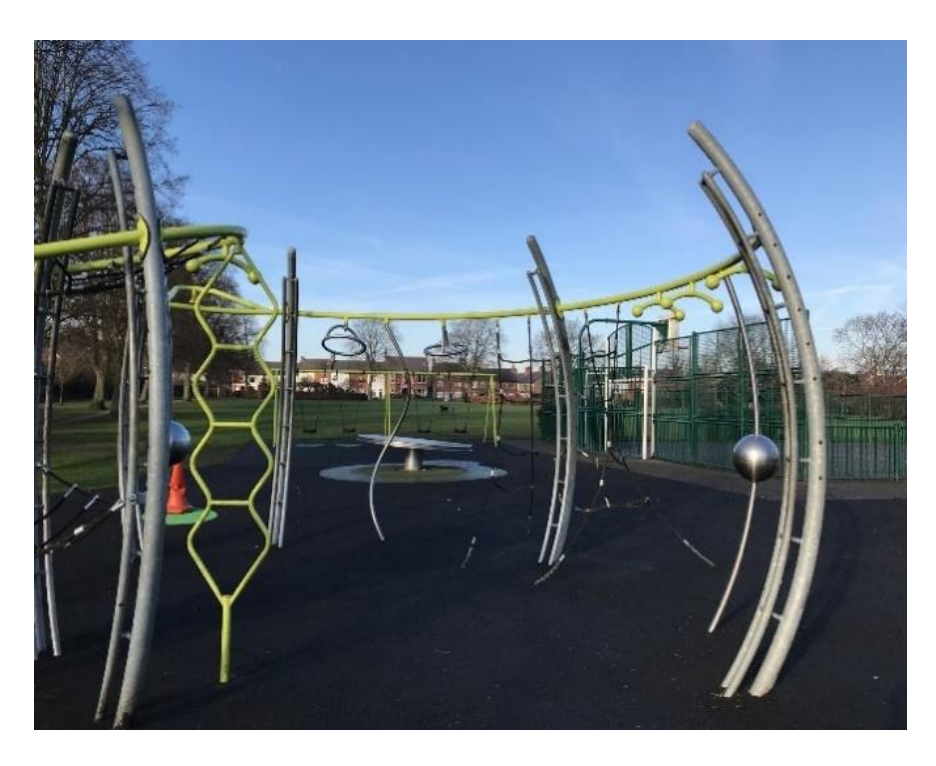
Older children's play equipment, January 2020.

Additionally, the park provides volunteering opportunities, such as for park wardens or for organising events.