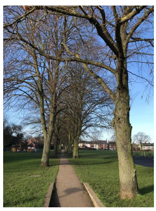
Avenue of lime trees, January 2020.

Quorn Parish Council continues to manage and maintain Stafford Orchard, and are committed to continuing with the Green Flag award scheme. Most of the Parks for People project team have now retired from the parish council but remain active as members of the Stafford Orchard Advisory Group, advising the council on matters related to the park. Some members of the team expressed concerns that subsequent councillors may not be as invested in safeguarding the future of the park, particularly once the requirements for a management plan are fulfilled with the funder after 10 years, however the current parish council has made a long term commitment to maintaining the park (discussed in more detail in Challenges and Opportunities section).