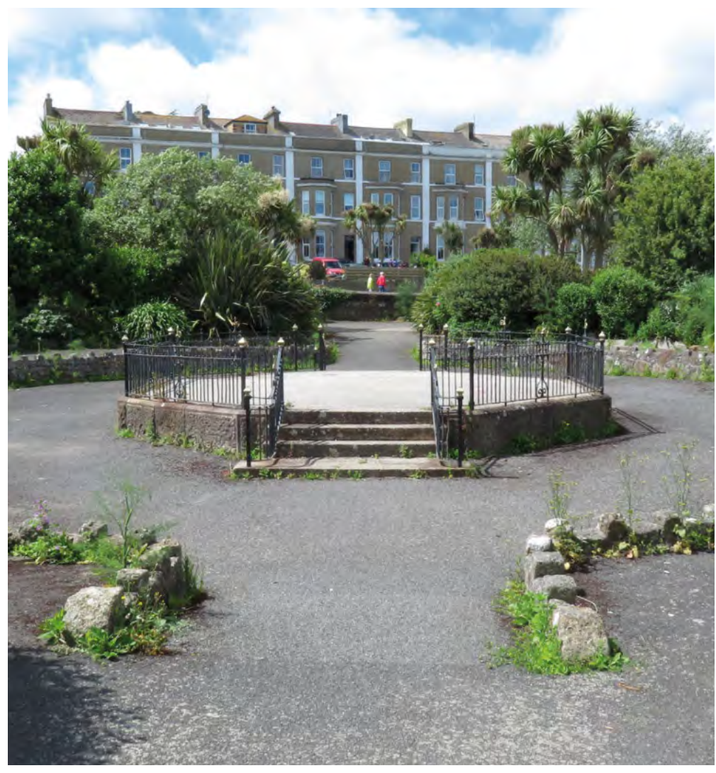
It appears that the condition of many parks has now reached a tipping-point when they are expected to fall back into a state of decline and neglect.