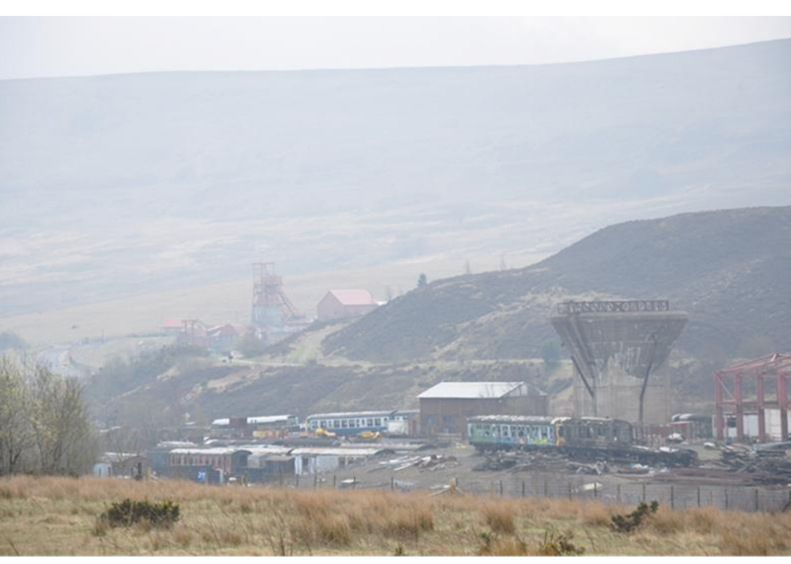
Blaenavon 'Forgotten Landscapes' April 2011 (R Clarke)