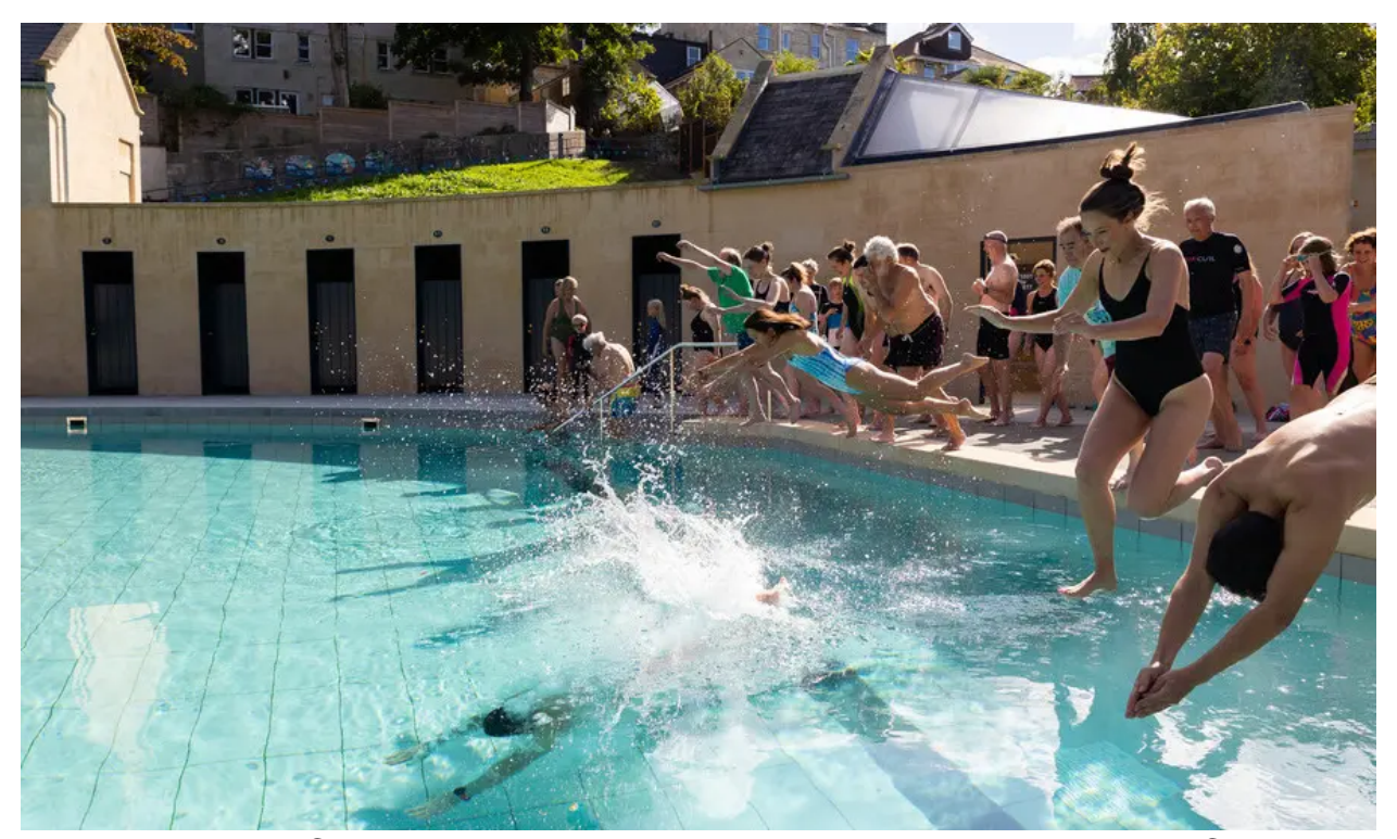
People diving into Cleveland Pools at the celebration event in Autumn 2022.

In Autumn 2022, 100 lucky competition winners were the first to dive into the Pools following a ballot for tickets. For some, it was their first swim but for others, it brought back memories of childhood swimming there over 40 years ago.