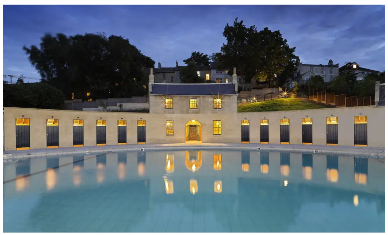
Cleveland Pools at night.

For the latest news on the restoration project and to book swimming, visit Cleveland Pools Trust.