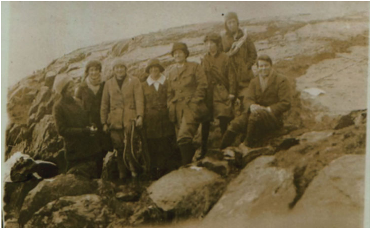
The Pinnacle Club's first meeting in 1921

Climbing provides an opportunity to get close to nature, and has incredible mental wellbeing and physical health benefits. The club hopes the series of blogs will inspire people of all backgrounds and ages, particularly women, to see how climbing can offer escapism from their everyday lives and build a stronger connection with our natural heritage.