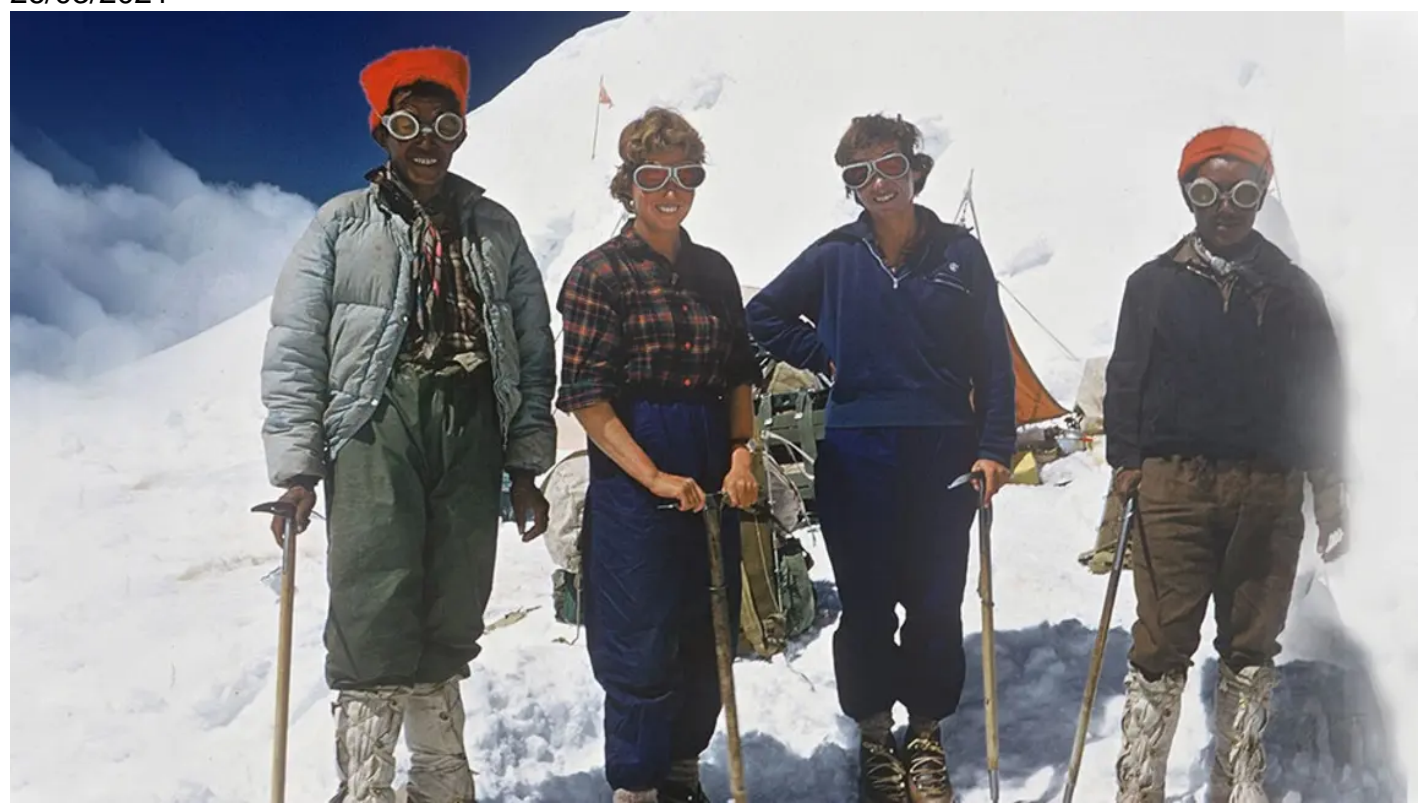
Thanks to a National Lottery grant, the Pinnacle Club is celebrating 100 years as the UK's first national women's rock-climbing club.

Today (26 March), the Pinnacle Club celebrates its 100th anniversary. The club have marked this achievement with the launch of The Pinnacle Club Centenary Project, funded by The National Lottery.