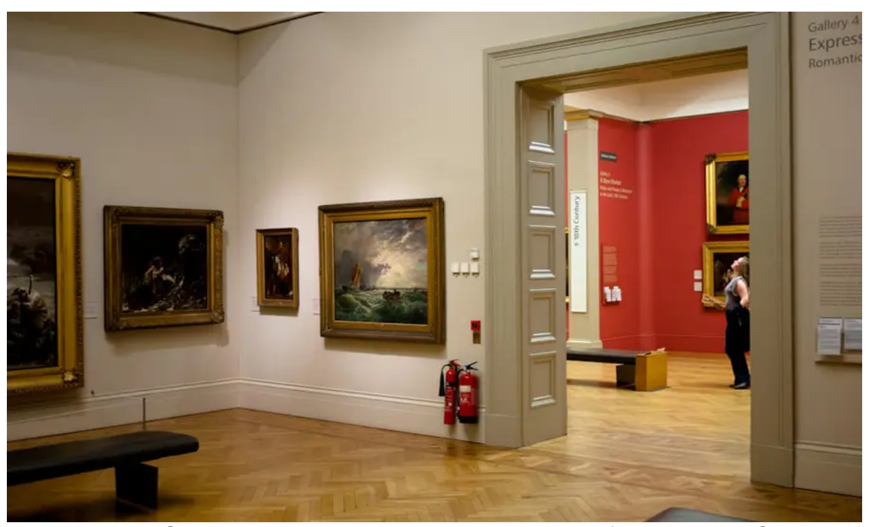
Manchester Art Gallery was used as an example in the report for their British Sign Language (BSL) tour videos available on their website.

"It is vital that this is from the top down – venue leadership needs to set the expectation that it is embedded into everything, not added as an afterthought or subject to demand. We encourage people throughout museums and the heritage sector to read the report and be part of making change at your venue."