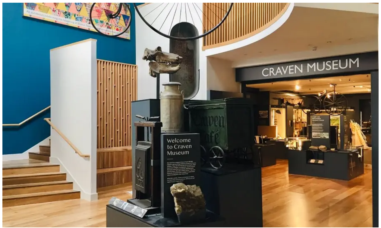
The Craven Museum and Gallery in Skipton scored 60 in the benchmark, placing it third out of the museum and heritage sites surveyed.

"When venues contact us regarding their score, it's important to remind them that even small changes to their access information can make a difference in how someone with access requirements may perceive their site."