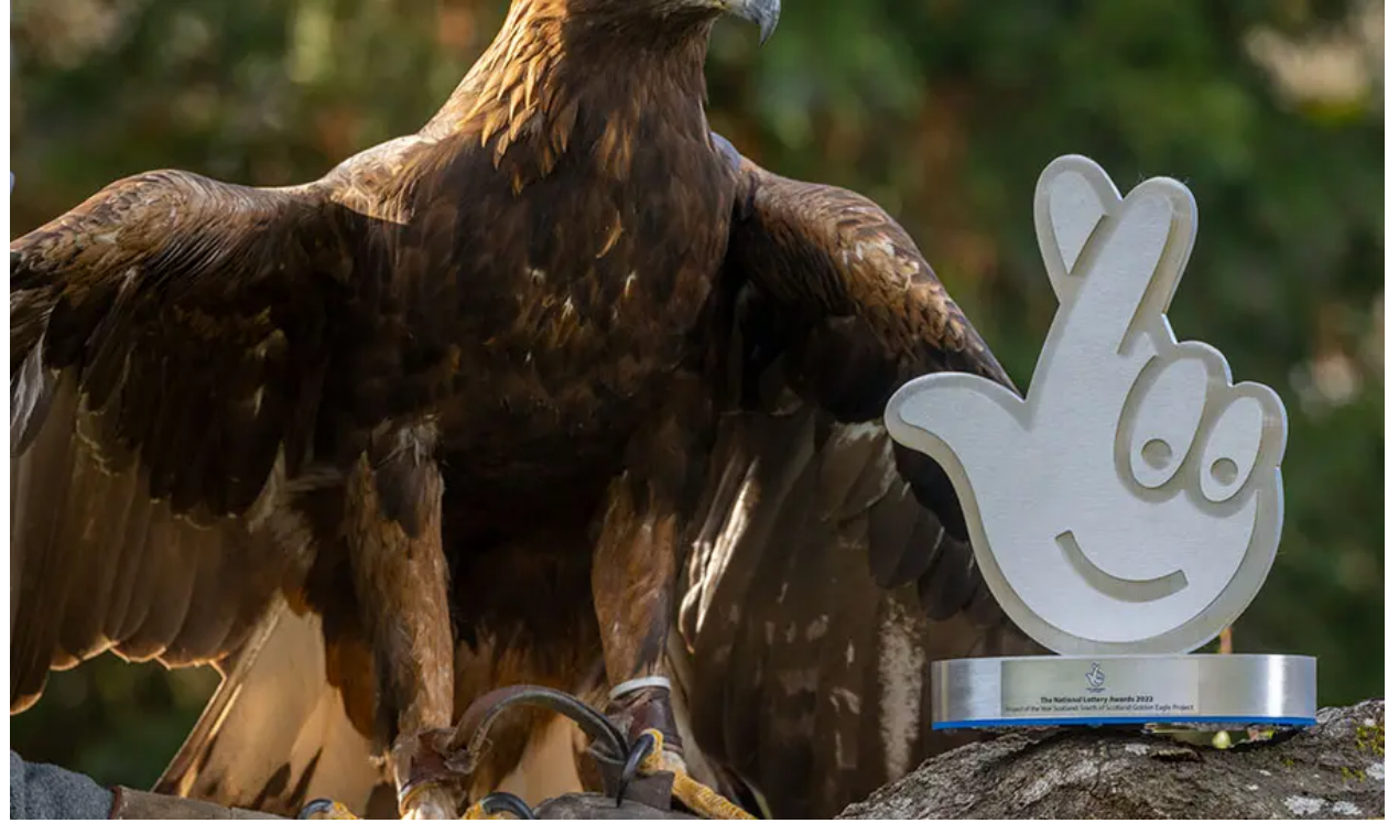
A golden eagle next to the National Lottery award.