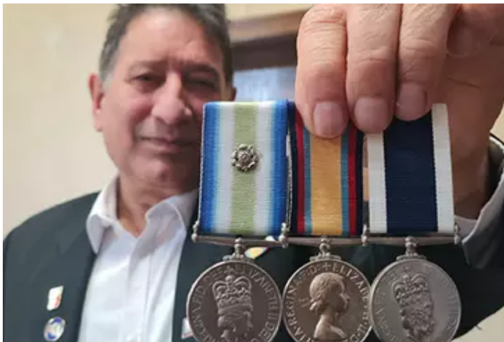
Commonwealth Contribution Memories.

Pupils from Bowling Park Primary School worked with a local author, illustrator and historian to create an immersive picture book telling the story of Bradford.