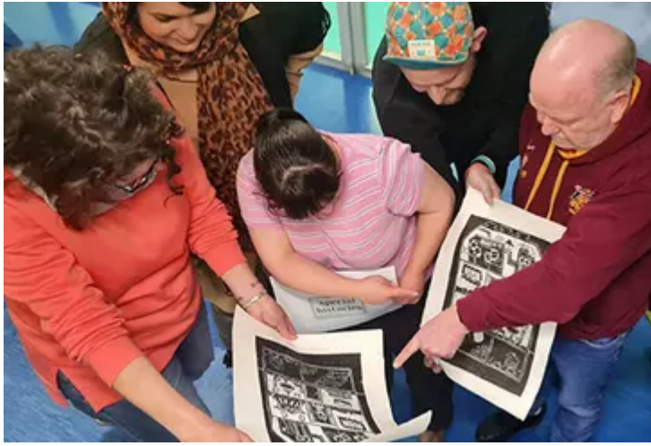
'Special' Histories of Bradford.